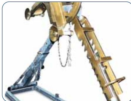
Included in the Mod. CVI 602