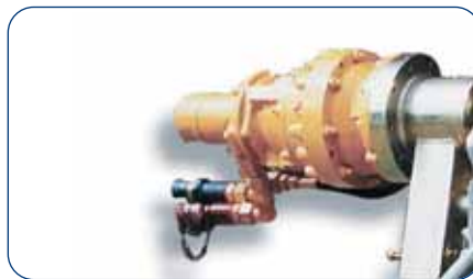
Mod. TIH 002